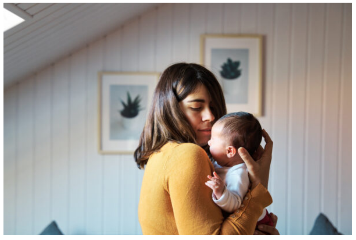
Life for mothers changes through different stages of childhood, but the key is to be crystal clear on your priorities and remind yourself that you're doing your very best.

"It's been interesting to see how many people still find their way in every group. It's not limited to any age group."