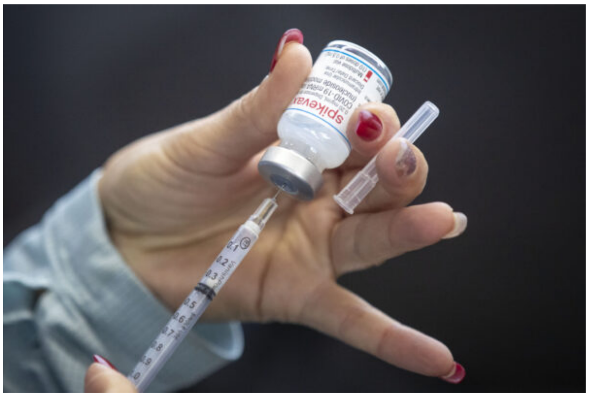
A health worker draws out Moderna vaccine during a drive-through COVID-19 vaccine clinic at St. Lawrence College in Kingston, Ont., on Jan. 2, 2022.