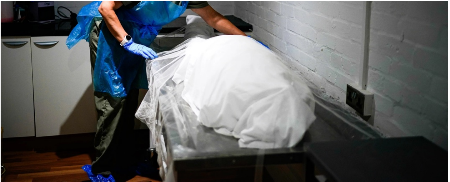
An embalmer wears personal protective equipment while preparing a deceased person in Shipley, England, on May 21, 2020.

"It's all nonsense, COVID vaccine conspiracy-theory [expletive]," a Canadian embalmer told The Epoch Times in an email. "We embalm over 400 bodies yearly and have never seen [this]."