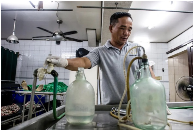
An embalmer prepares embalming instruments before operating on a body, inside the morgue of Veronica Memorial Chapel in Manila, Philippines, on Oct. 30, 2016.

The funeral director said before the embalming process, they've begun asking if the person had been vaccinated and boosted.