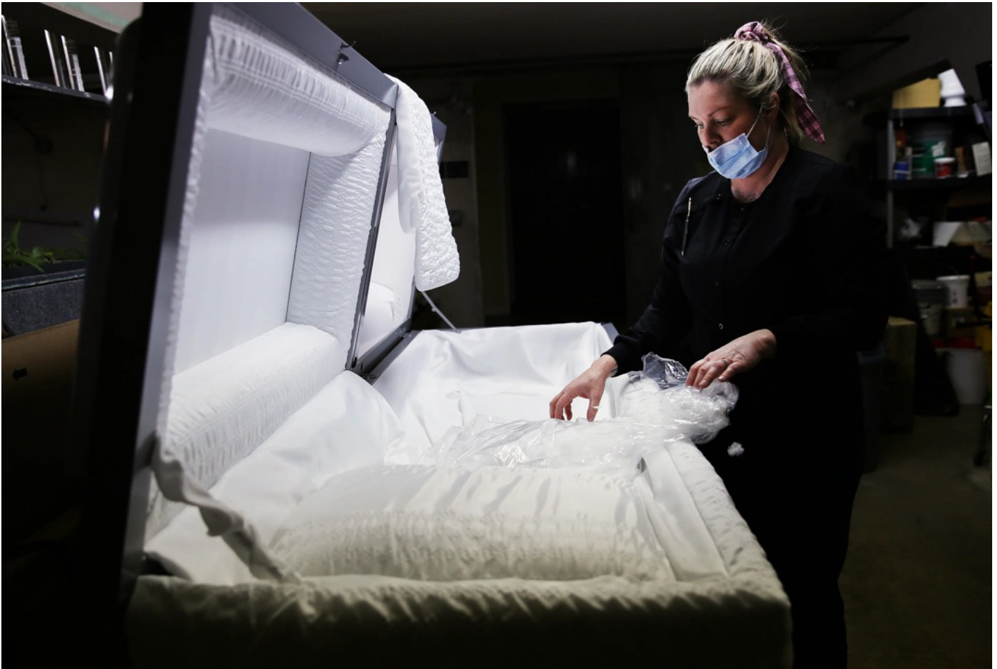
An embalmer prepares a casket at East County Mortuary in El Cajon, Calif., on Jan. 15, 2021.