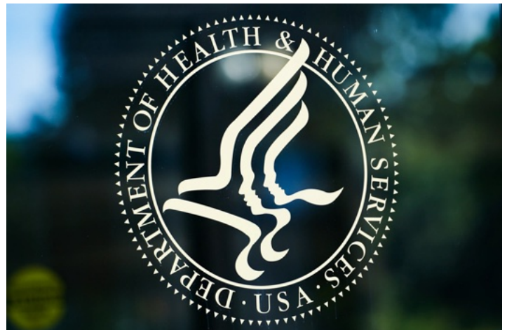
(Left) U.S. Food and Drug Administration (FDA) in White Oak, Md., on June 5, 2023. (Right) U.S. Department of Health and Human Services in Washington on July 6, 2023.