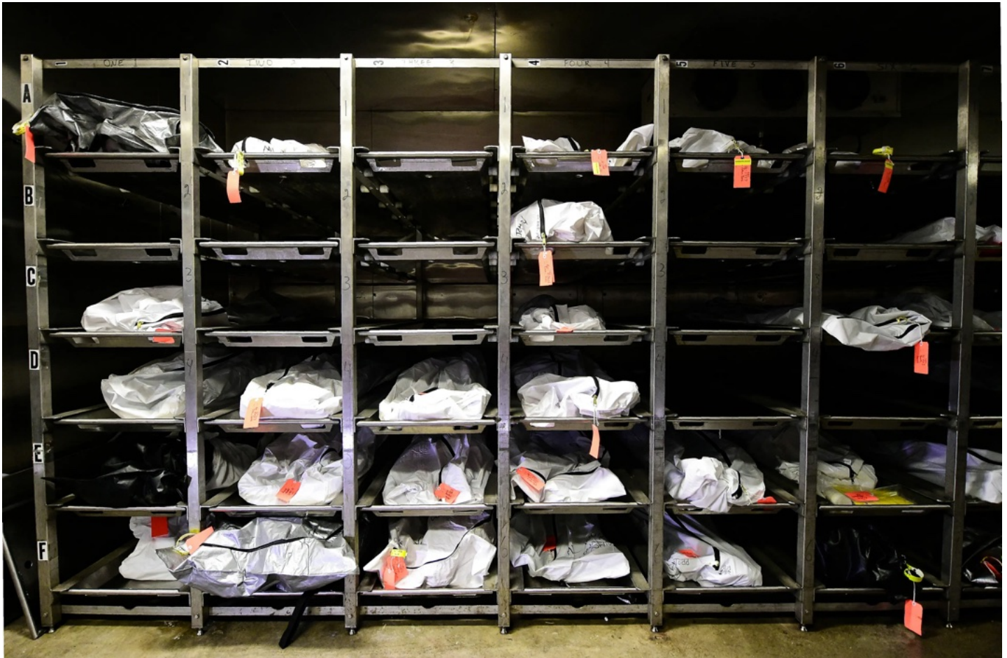
Body bags in the morgue at the Pima County medical examiner's office in Tucson, Ariz., on Oct. 13, 2016.

"She has been an embalmer for about 20 years. I then asked my manager, who is also an embalmer, and he said he had seen them prior to COVID, and there was no link," the embalmer said. Since the first discovery, he says he still sees the strange white masses "fairly regularly—in various sizes, with and without the fatty clots, and normal red blood clots."