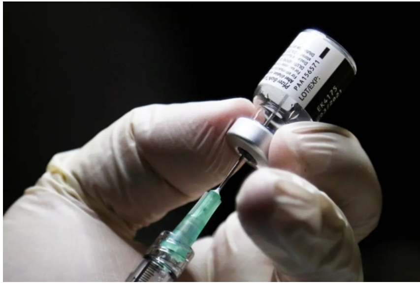
A healthcare worker prepares a dose Pfizer/BioNTech COVID-19 vaccine in Toronto on Dec.14, 2020.